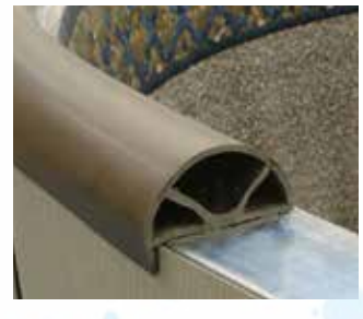
Optional Deck Mount