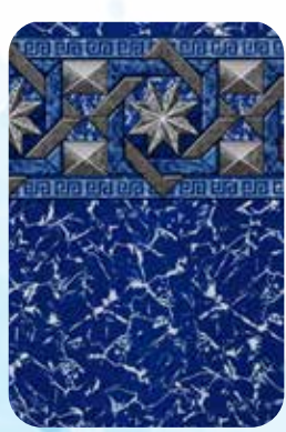
Evening Star - 20 mil flat bottom only