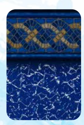
Dynasty - 20 mil flat bottom only

Dynasty and Evening Star only available for rounds and ovals. Inground liner patterns available upon request.